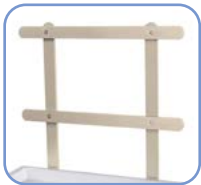
2-Tier Back Rail (MR-RBR2)