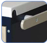
(4) 12" Side Rails (MR-SR)