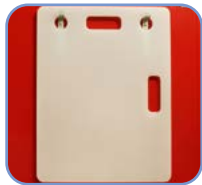
Cardiac board and brackets (MR-CARDBRD)