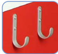
(4) Utility hooks (MR-UHOOKS4)