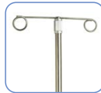
IV pole (MR-IV2)