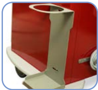
Oxygen tank holder (MR-ALO2)